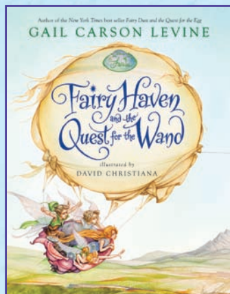
Fairy Haven and the Quest for the Wand