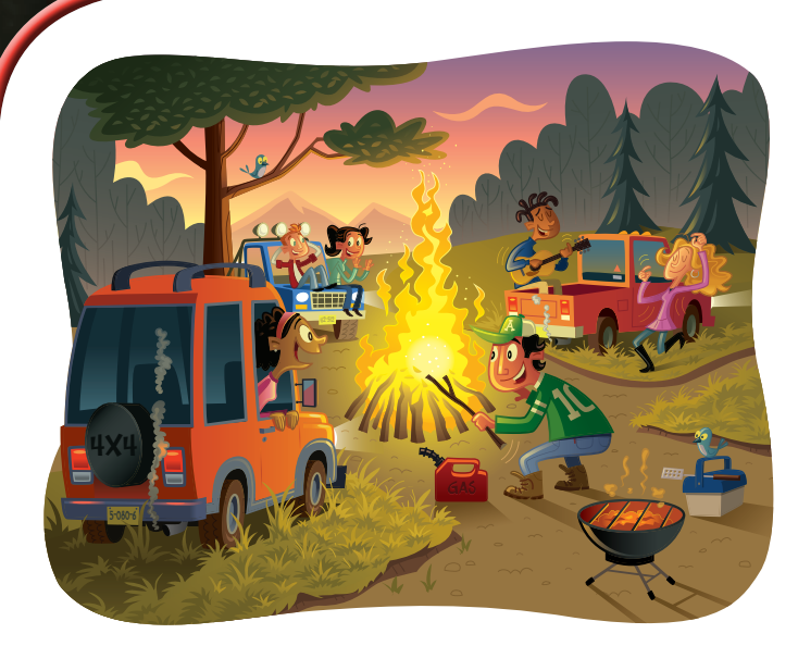
1. What wildfire prevention advice would you bring to this party?

Can you spot a wildfire before it starts? Test your Wildfire Detective skills by studying these outdoor scenes!