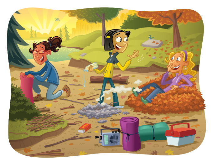
3. Can you tell these friends the safe way to leave a campsite?